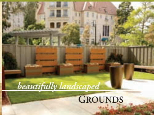
beautifully landscaped GROUNDS